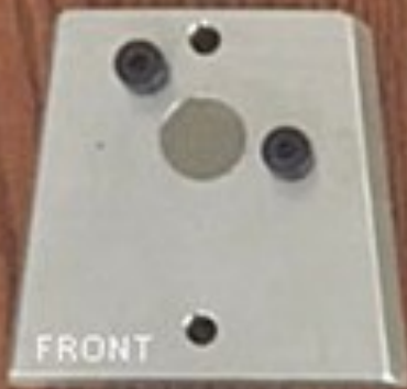
Magnetic Plate Adaptor