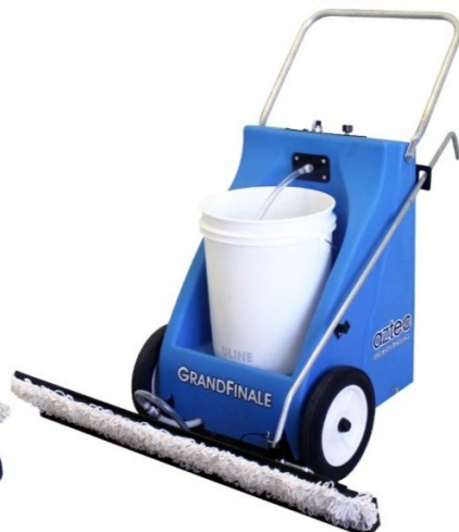
36" Head Assembly: ID# 050-1, 050-H-36