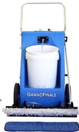
24" Head Assembly: ID# 050-1, 050-H-24