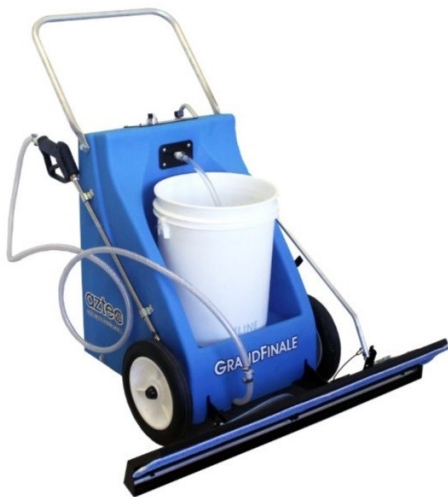
Spray Wand Upgrade: ID# 050-1S, 050-H-36

No puddles, dry spots or streaking thanks to the Grand Finale's battery powered precision release system. Step 5 in the WorkSmart™ VCT Strip System, or as part of the WorkSmart™ Maintenance System or the WorkSmart™ Concrete System. Optional spray wand upgrade.