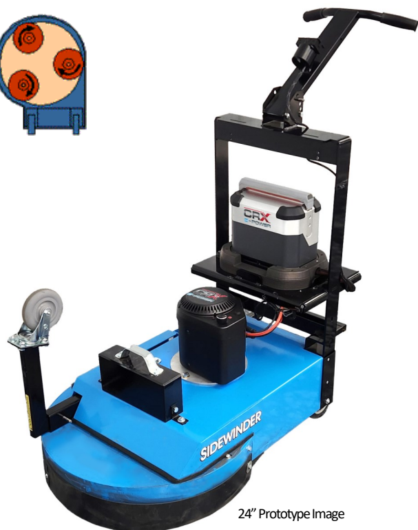
24" Prototype Image