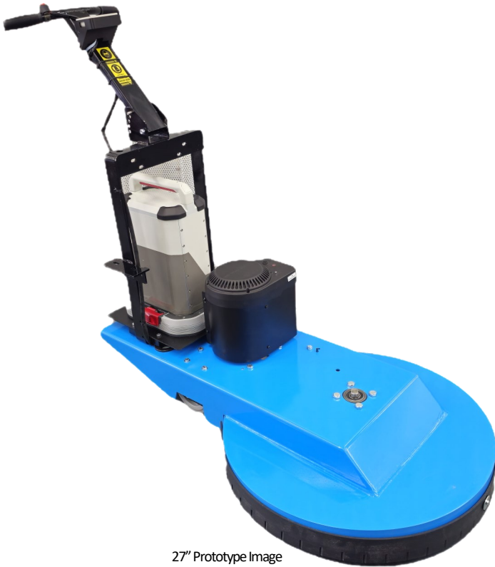
27" Prototype Image